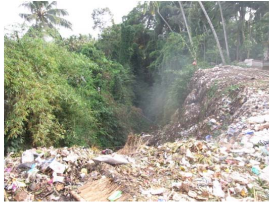
A valley being filled with illegally dumped waste within our project area