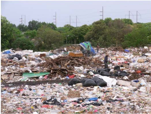
Illegal dumping in mangrove forest. The tidal hub pollutes the sea